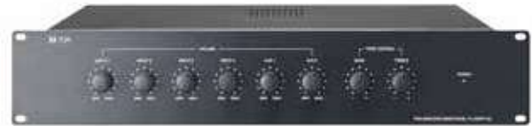
FV-200PP Pre-Amplifier Mixer Panel