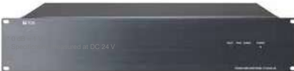
FV-224PA Power Amplifier