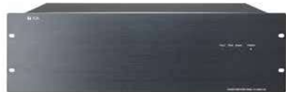
FV-248PA Power Amplifier

- Specification measured at AC 230V AC, 50Hz