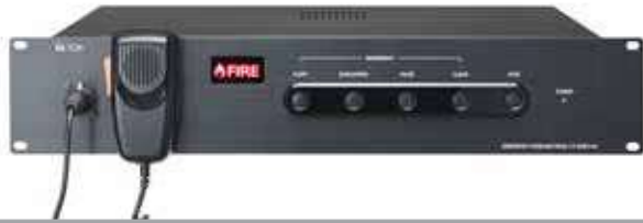
FV-200EV Emergency Message Panel