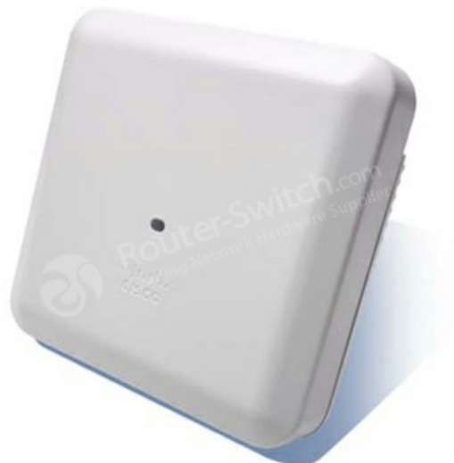
Figure 1 shows the face of AIR-AP2802I Model.