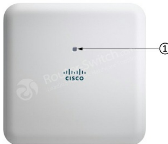
Figure 1 shows the AIR-AP1832I LED Indicator Position.