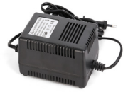
AC24V/3A Power Adapter