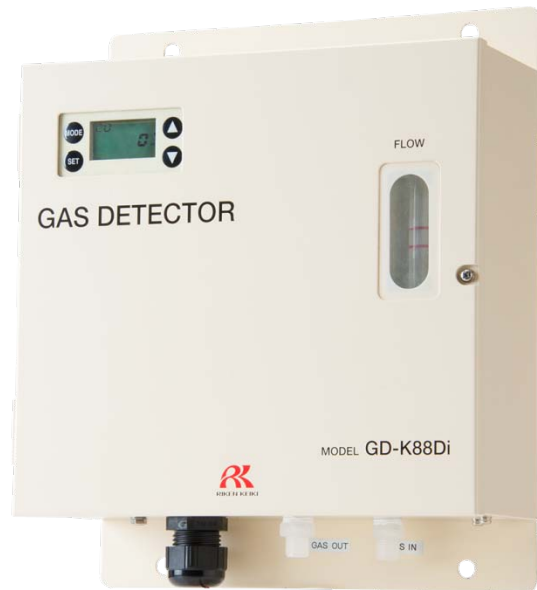
<Aspiration type> Model:GD-K88Di(Toxic)